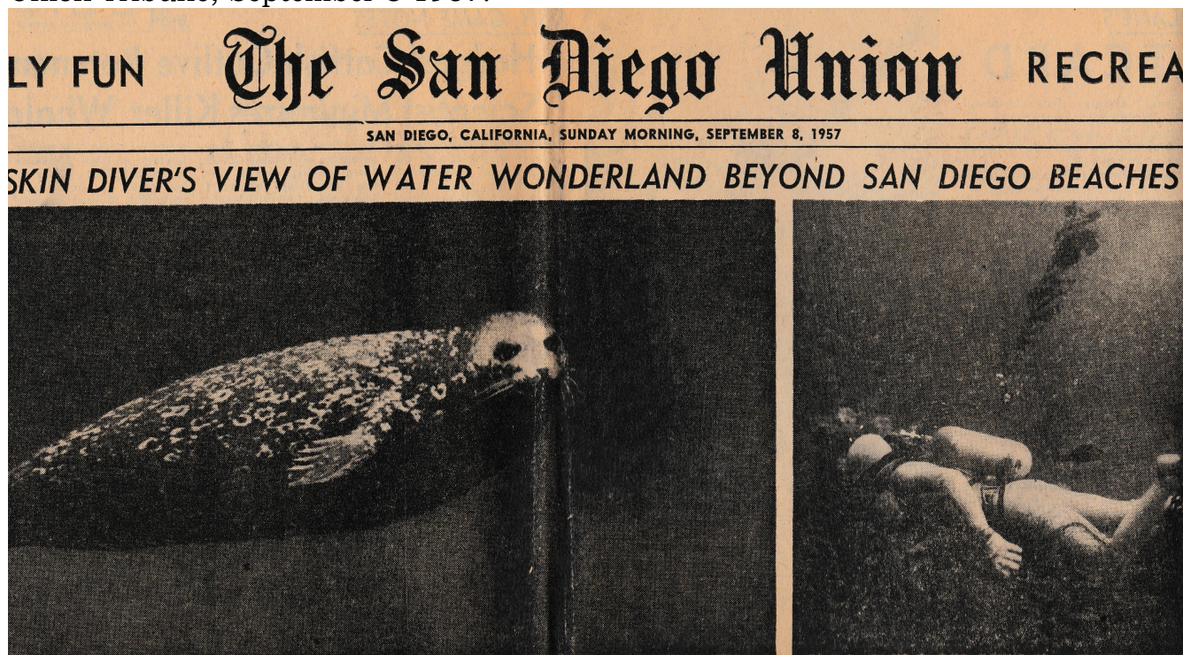
Figure 1: Original newspaper clipping saved by Frank from the San Diego Union Tribune, September 8 1957.