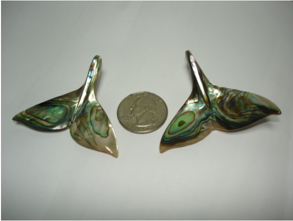
Figure 6: Later I asked Barbara about these and she sent me photos of her collection.