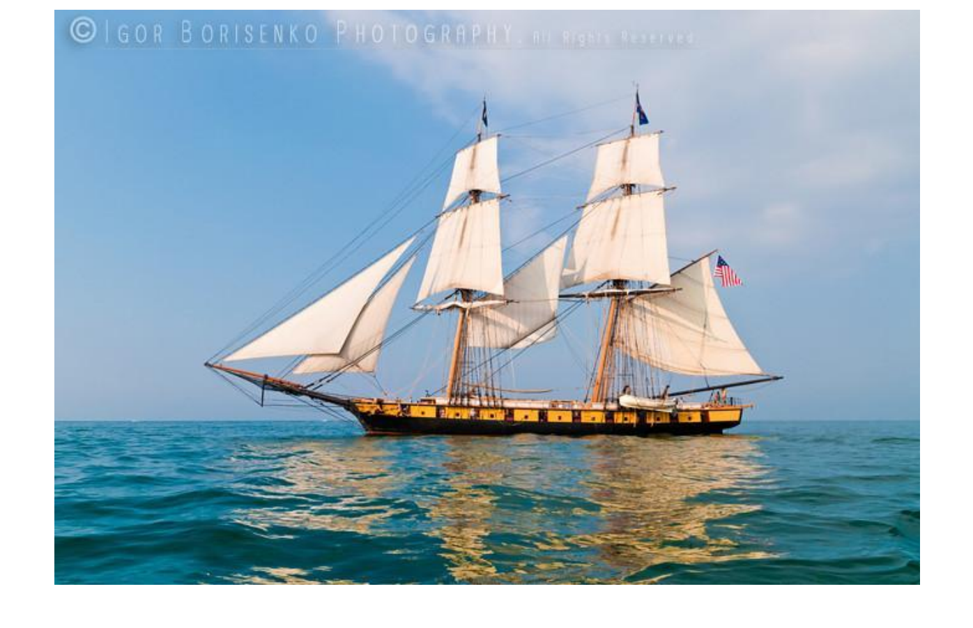
The USS Niagara