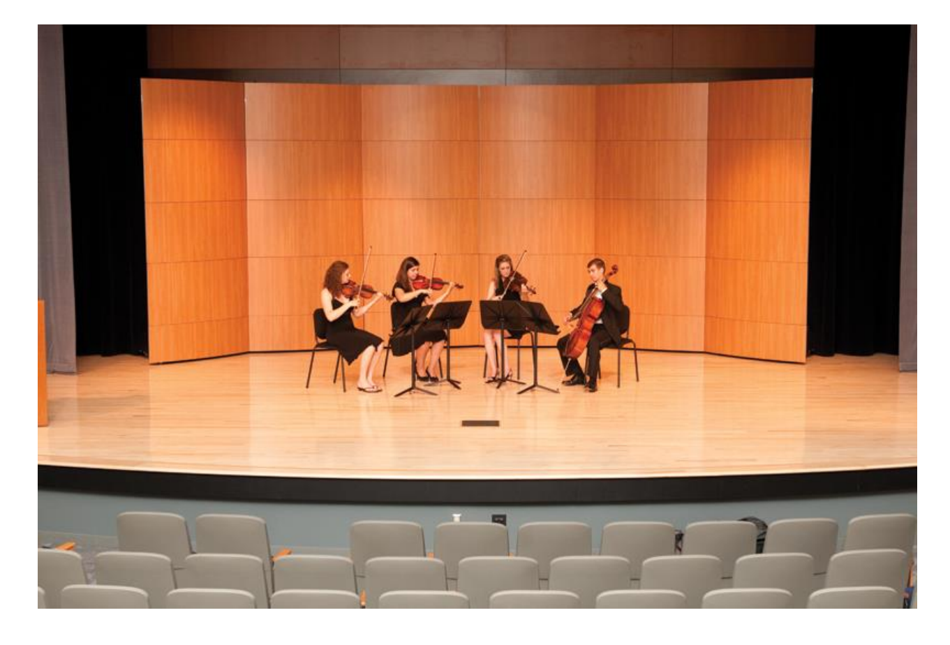
Example of a Sound Shell