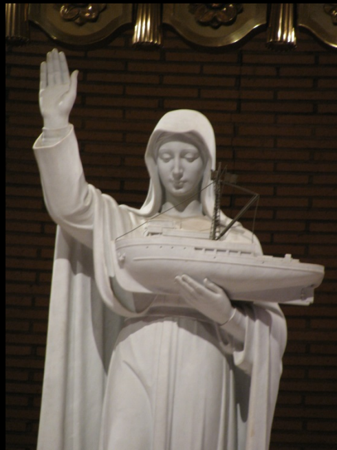
Virgin Mary statue inside Mary Star of the Sea Church, San Pedro. She holds a tuna seiner in her arms.