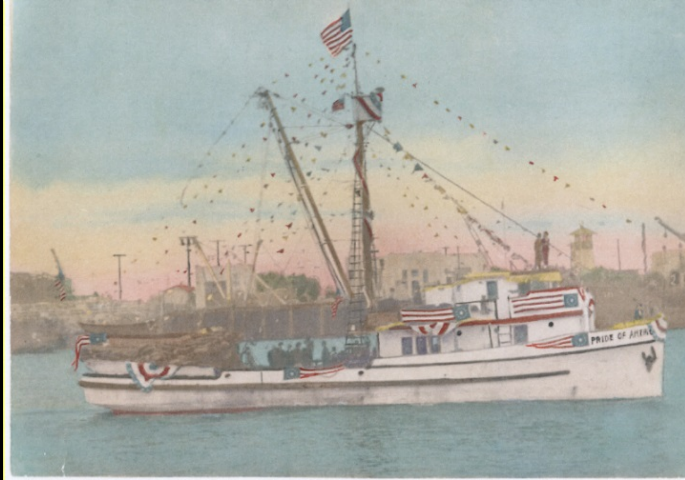
F/V Pride of America