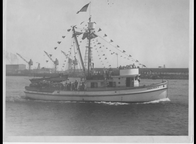
F/V Costa Rica II