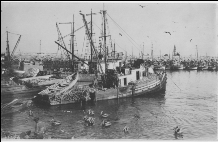
F/V Costa Rica